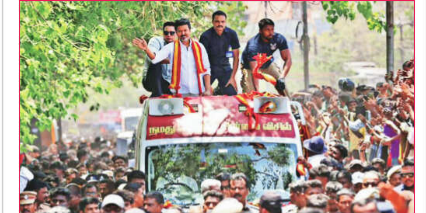
Actor and TVK chief Vijay during a roadshow ahead of filing his nomination papers for the Tiruchirappalli East Assembly constituency on Thursday.