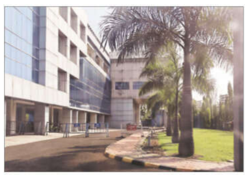
The Syama Prasad Mookerjee National Institute of Water and Sanitation where the tribunals were to conduct hearings

THE COUNTDOWN HAVING begun for the West Bengal electoral rolls to be frozen, all roads for those "rejected" lead to the gates of a stark grey steel-and-cement building in Joka, located 16 km from the heart of Kolkata.